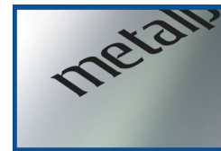
GLOSS highly reflective, mirror-like