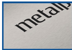
SATIN semi-gloss medium reflective material