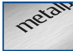
# 4 brushed to resemble a stainless steel finish