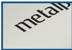
MATTE non-reflective with dull finish