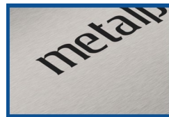
SATIN semi-gloss medium reflective material